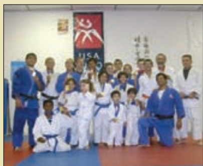
Coral Springs Judo Club Wins 14 Gold Medals on page 9