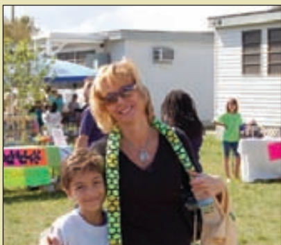
Carnival Held For Local Boy Who Suffered From Brain Hemorrhage on page 4